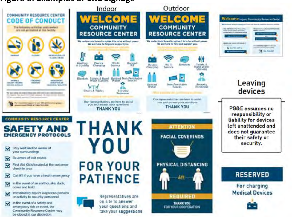
Figure 6: Examples of CRC Signage

PG&E contracted personnel greet all CRC visitors and are trained in CRC rules and code of conduct. Each CRC has posted signs to welcome visitors and inform them of all applicable rules. These signs are translated into commonly spoken languages in PG&E's service territory and can be printed as needed at the CRC. Additionally, staff are trained to offer to read signage for Blind customers.