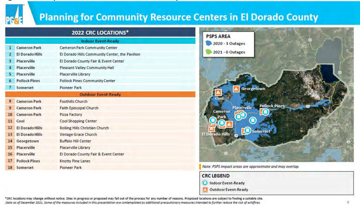
Figure 2: Sample outreach slide from February 2022<sup>1</sup>

As mentioned in Section 2.1, local governments (usually through the county Office of Emergency Management) were contacted by PG&E's dedicated Public Safety Specialists (PSS) in February 2022 with a map which depicted where PSPS events had impacted their county in 2020 and 2021 and locations of event-ready and in-progress CRC locations. See Figure 2 for an example from El Dorado County. With this, counties identified additional places for CRC locations where they thought there was a need. Similarly, PG&E's Tribal Liaisons met with Tribal governments in PG&E's service territory to review event-ready CRC locations on or near their Tribal lands to make sure their needs were met. Since this was the second year PG&E conducted outreach in this way, most counties did not have additional CRC location requests. All requests for additional indoor and outdoor CRC locations are being acted upon by PG&E's CRC team.