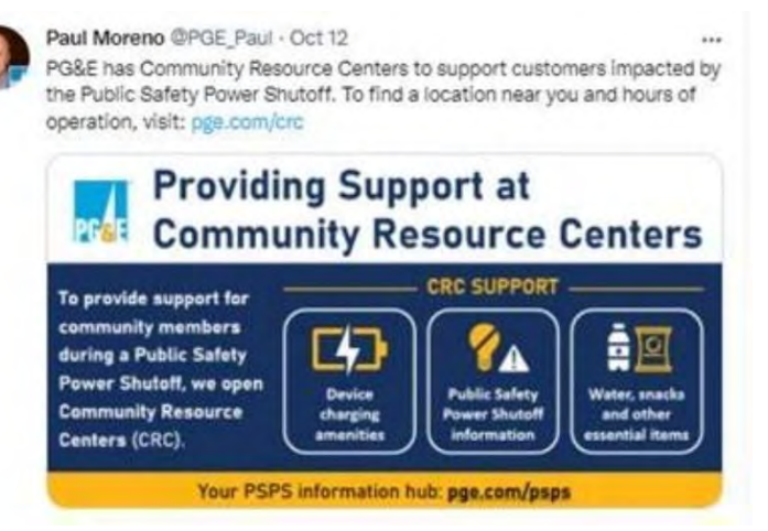
Figure 5: Sample Local Tweet

5 is an example of a tweet posted by a Communications Representative in Butte County during the October 12, 2021 PSPS. PG&E also relies on its network of CBO partners to share CRC information.