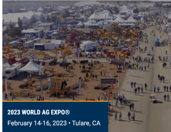
2023 WORLD AG EXPO® February 14-16, 2023 • Tulare, CA