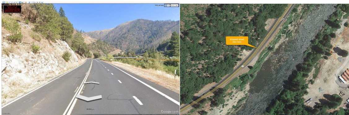
FIGURE RN-PG&E-23-05-1: EXAMPLES OF TERRAIN FEATURES THAT IMPACT PROJECT FEASIBILITY

On a final note, PG&E's mitigation selection process in the 2023-2025 WMP follows the Safety Model Assessment Proceedings (S-MAP) Settlement Agreement requirements. 34 The S-MAP Settlement Agreement requires utilities to calculate an RSE but says that the utility is not bound to select its mitigation based solely on RSE ranking but can consider other factors including execution considerations. 35 By relying on the WFE to justify mitigation selections in the WMP, PG&E incorporates the elements of an RSE (risk reduction and cost) along with execution considerations (terrain difficulties). Using the WFE is a reasonable approach for identifying where we can most efficiently reduce risk.