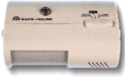
Figure 1: Image of a modified infrared motion detector.

The infrared motion detector used to assess occupancy patterns within a space is a simple, off-the-shelf, battery-operated device typically used as a door chime/alarm similar to the sensor one might trigger when walking into a store. The PEC has modified the motion detector for use with a HOBO logger or ACR Smartreader 7. This is a simple procedure that enables an inexpensive occupancy sensor to send a voltage signal to a datalogger.