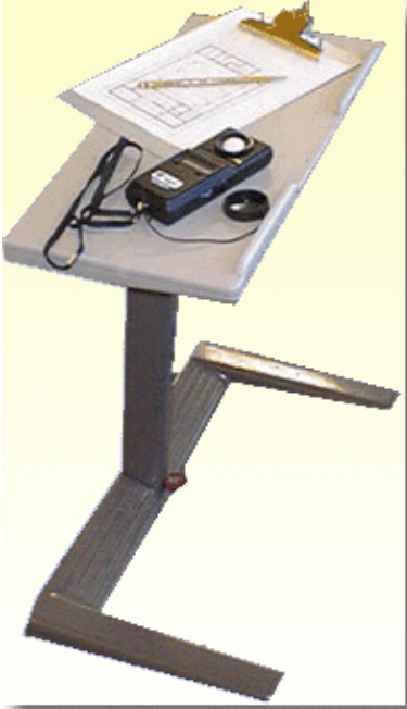
Figure 1: Set-up for a typical illuminance field study, complete with floor-plan, table (30" ht.), and illuminance meter.

By assessing the amount of light striking surfaces, illuminance field studies provide useful information about the quantity and quality of light in a space. Gathering illuminance data can help determine whether the lighting in a space is adequate or if there is too much contrast across a work area for the completion of required tasks.