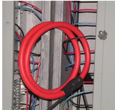
Figure 5: Double wrap the CT to increase sensor sensitivity.

If the load being measured is too small for the CT to detect, double wrap the transducer loop around the conductor to increase sensor sensitivity. This will effectively double the mV output to the logger. If the CT is doubled program either 150A or 1500A (depending on which range has been selected on the sensor box) into the CT ratio field of the data logger's set-up table. The Flex CT will require at least 12A of current to measure accurately, even when doubled.