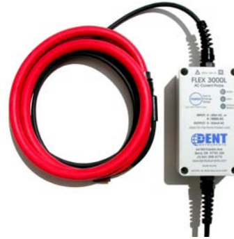
Figure 1: Dent Instruments flexible current transducer.