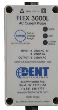
Figure 2: Sensor box