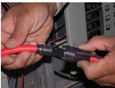
Figure 3: Squeeze the clip to release the sensor loop.