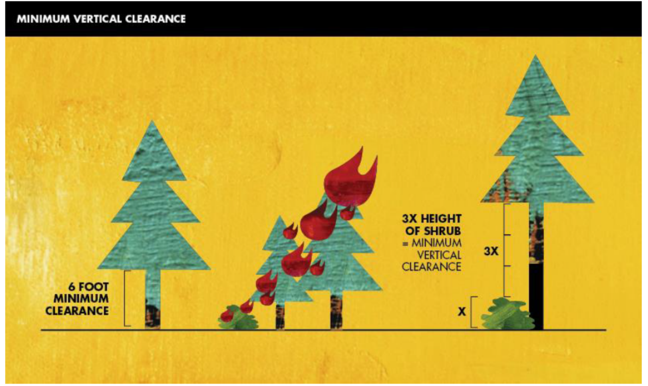
Figure 3. A Five Foot Shrub is Growing Near a Tree. 3x5=15 feet of clearance needed between the top the shrub and the lowest tree branch