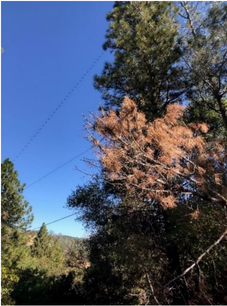
Figure 1 – Tree Fall Near 10 Mayberry Rd, Oroville