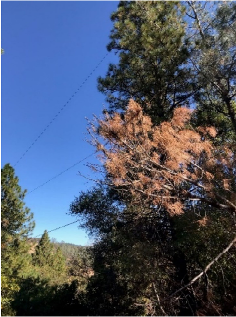
Figure 1 – Tree Fall Near 10 Mayberry Rd, Oroville