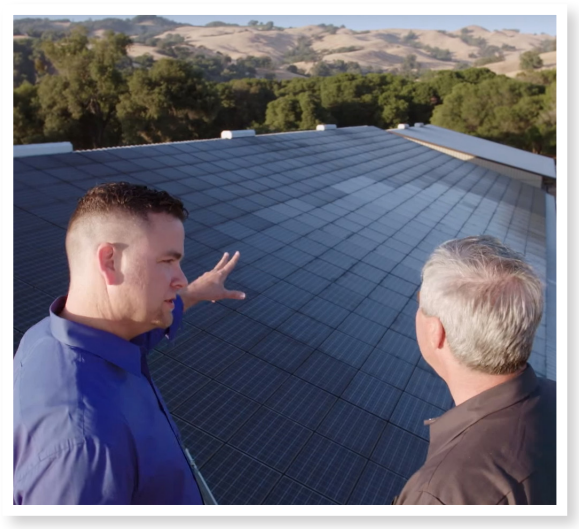
Chambers of Commerce are critical to local businesses.

$7.5K to <u>Meals on Wheels</u> in Sonoma County to help provide seniors who sheltered in place during the pandemic with meal bags, hand crank radios and county emergency information pamphlets, as well as serving 1,200 seniors through new Drive-Up Pick-Up meal sites.