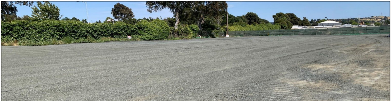
View of the Site after remediation and restoration.

This fall, PG&E will return to the site to restore the boat launch parking lot and conduct post-remediation sampling. Boat launch Parking Lot restoration work will be conducted in accordance with permits from the San Francisco Bay Conservation and Development Commission (BCDC) and the City of Vallejo. Post-remediation sampling will be conducted under DTSC oversight. This work supports preparing the site for future redevelopment by the City of Vallejo.