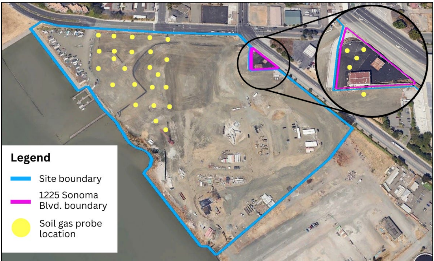
Figure 2 – A map showing the soil gas sampling locations.