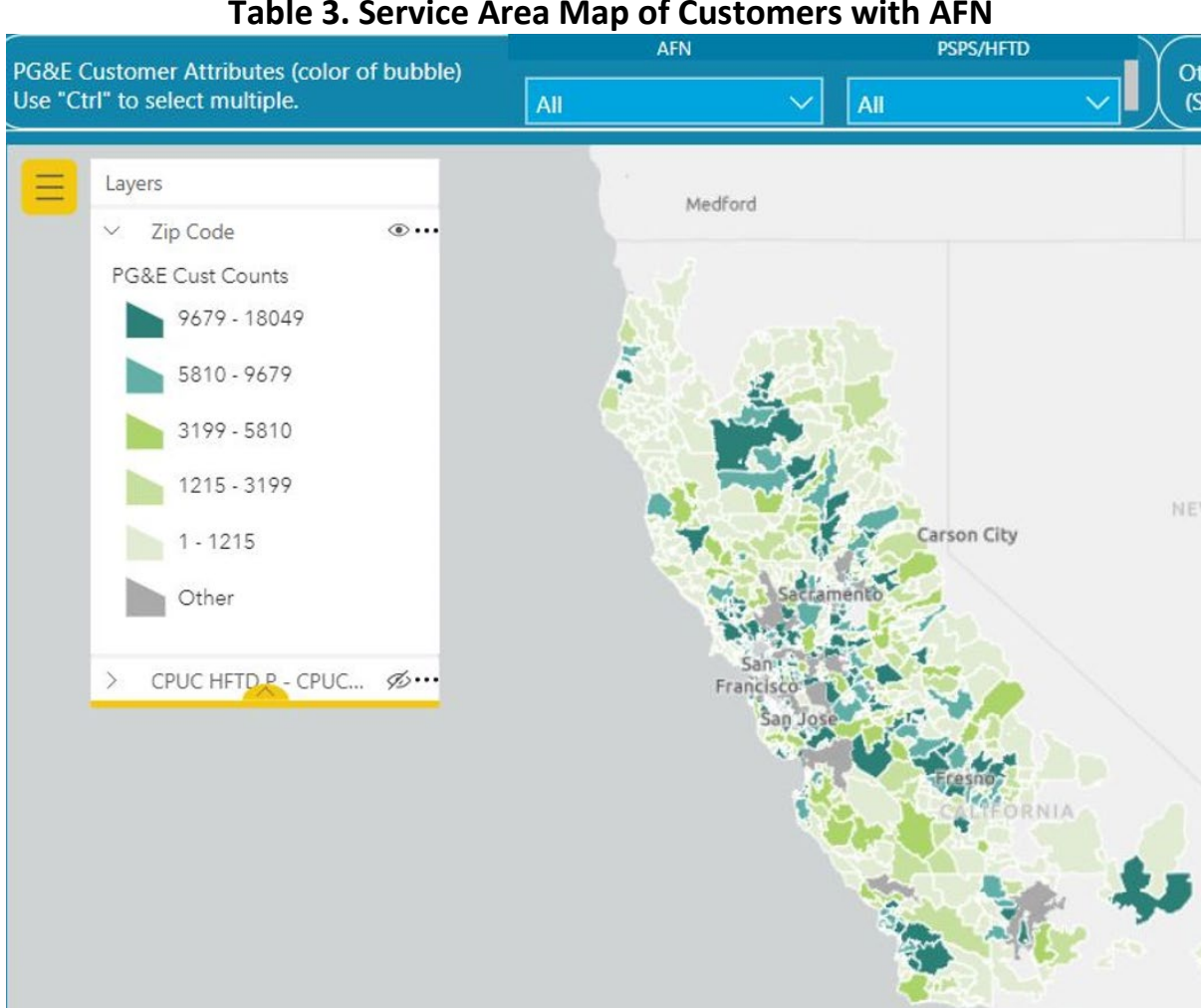
Table 3. Service Area Map of Customers with AFN

The Joint IOUs have an AFN density map for quick identification of geographical areas that have larger populations of AFN individuals<sup>15</sup>. These maps enable the utilities to strategically allocate resources by geography such as staffing a support site or Customer Resource Center for individuals who are experiencing a PSPS. See Table 3 below.