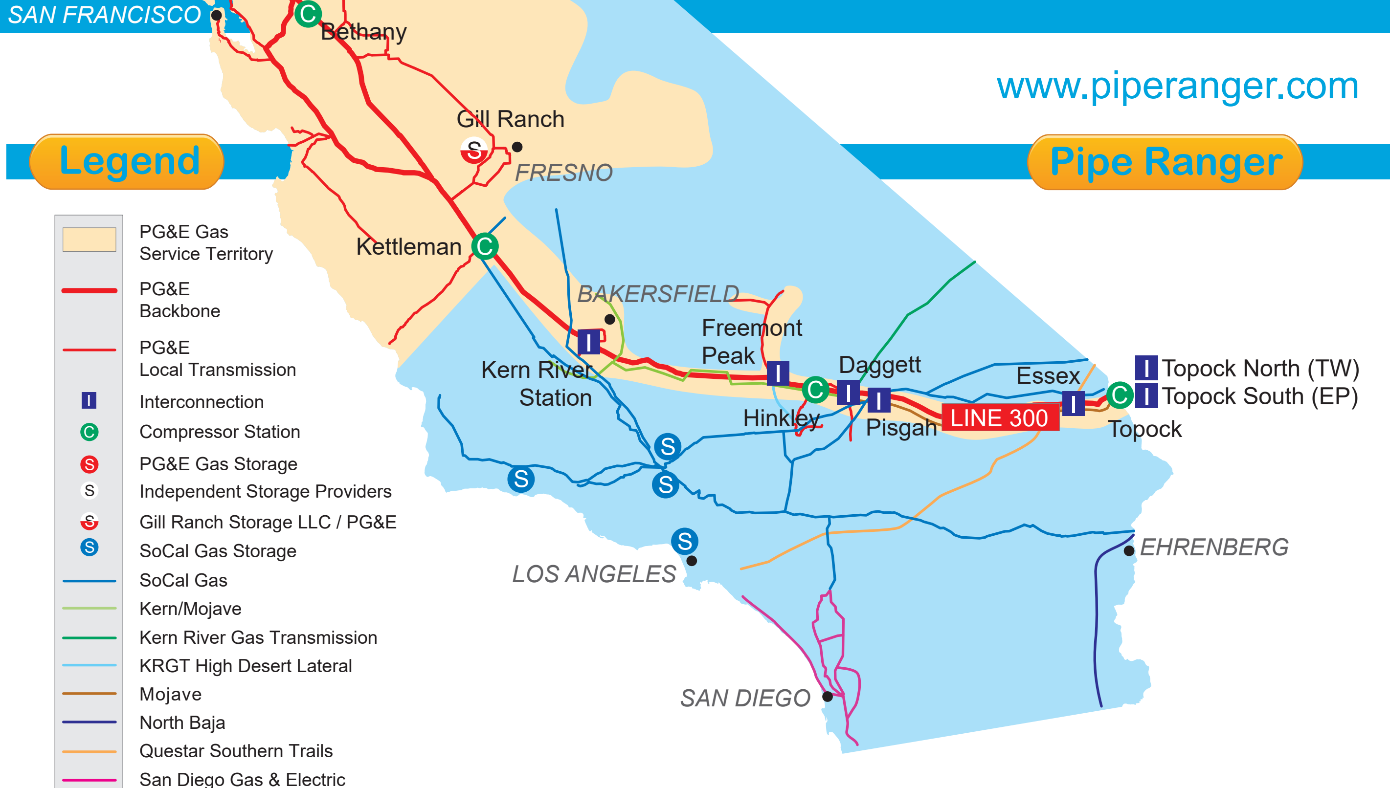
Baja to On- or Off-System